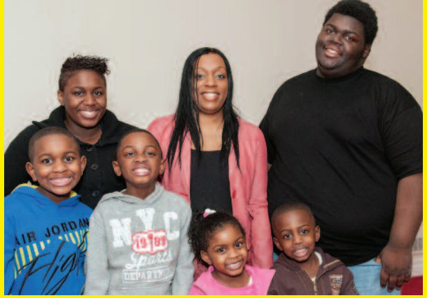
The Ware Family IHN Guests